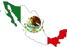
Ensenada, Mexico La Paz, Mexico