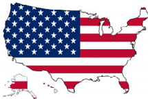
Redondo Beach, USA