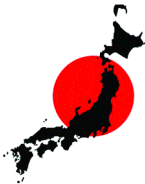
Itoman City, Japan